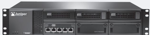
IC6500 / IC6500 FIPS