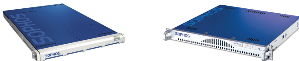
ES5000 (ES8000 is identical) and ES1100: fully integrated email gateway protection from Sophos