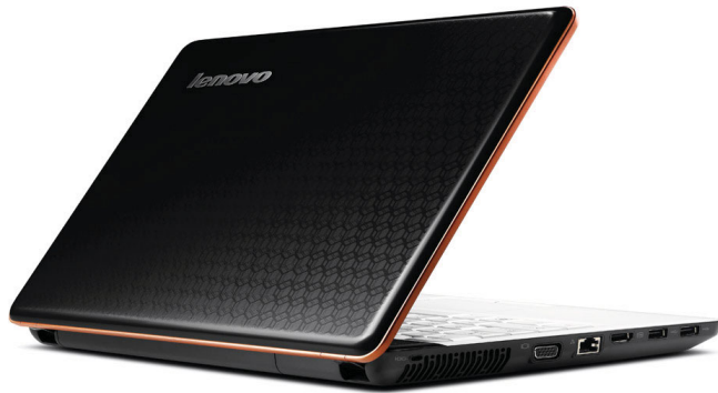
Lenovo IdeaPad Y450