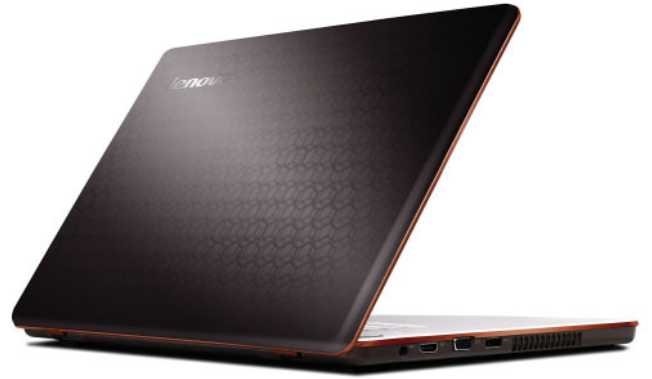
Lenovo IdeaPad Y650