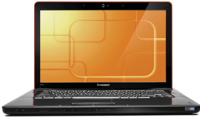
Lenovo IdeaPad Y550