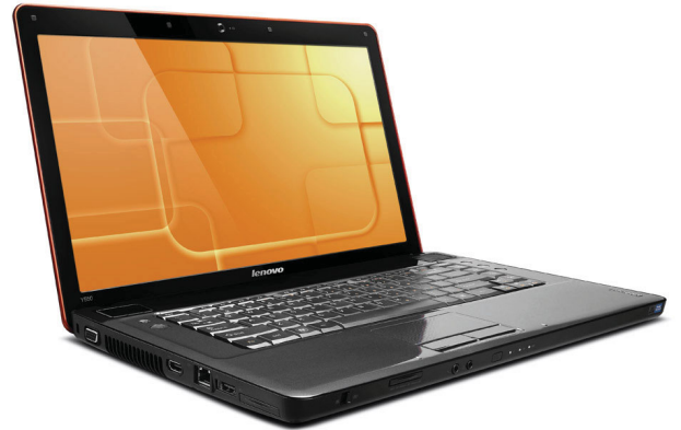
Lenovo IdeaPad Y550