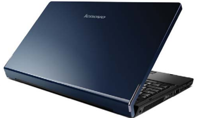
Lenovo IdeaPad Y730 Dark Blue, Glossy Finish