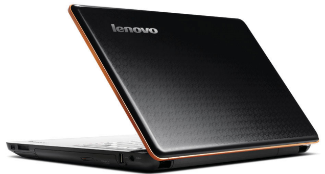
Lenovo IdeaPad Y450