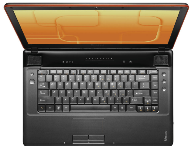
Lenovo IdeaPad Y550