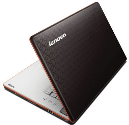
Lenovo IdeaPad Y650