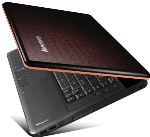
Lenovo IdeaPad Y550