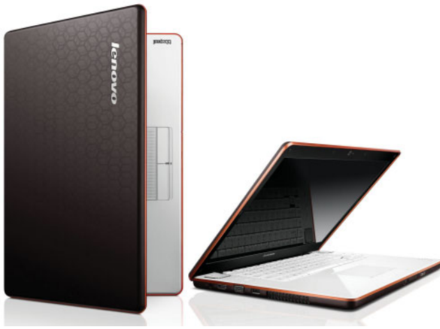
Lenovo IdeaPad Y650