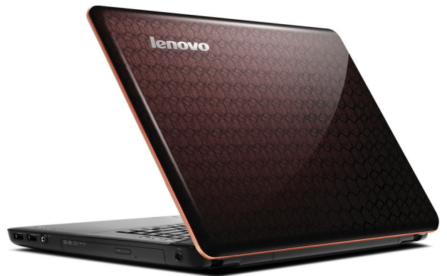
Lenovo IdeaPad Y550