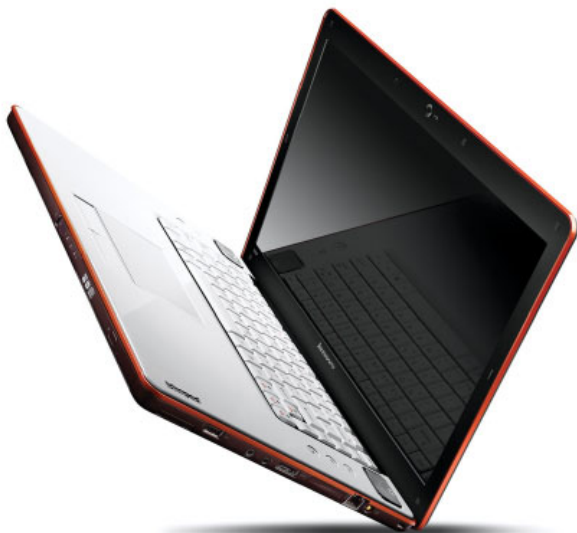
Lenovo IdeaPad Y650