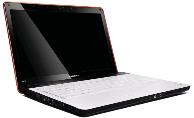
Lenovo IdeaPad Y450