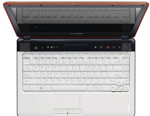
Lenovo IdeaPad Y450