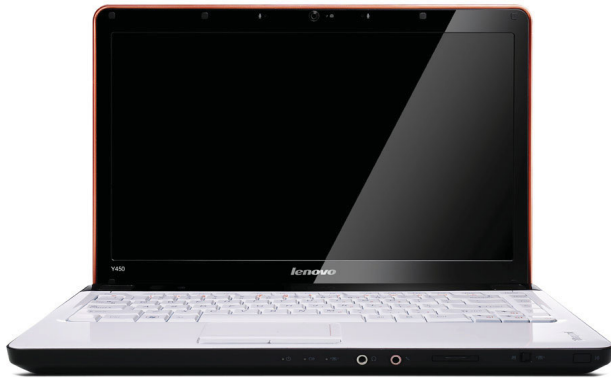
Lenovo IdeaPad Y450