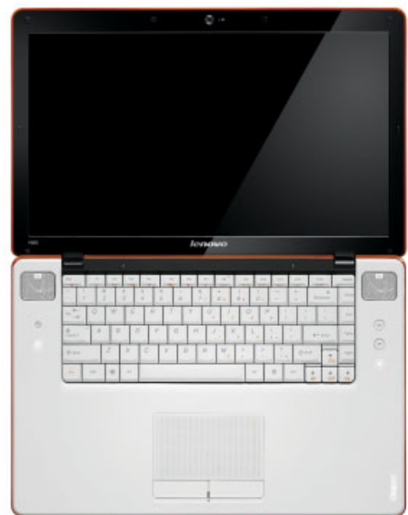
Lenovo IdeaPad Y650