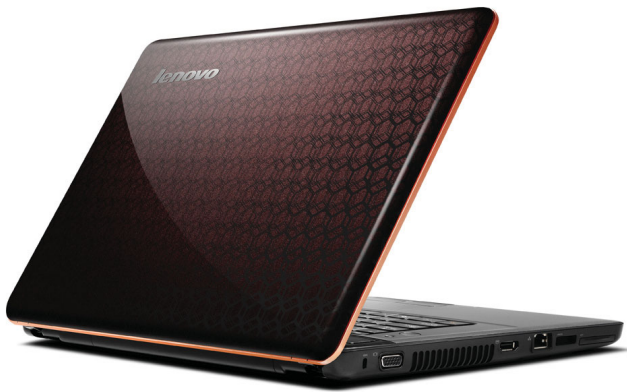
Lenovo IdeaPad Y550