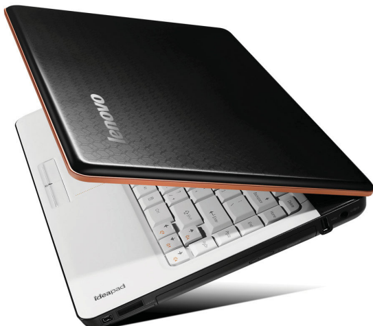
Lenovo IdeaPad Y450