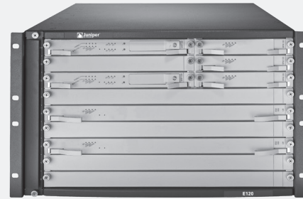
E120 BROADBAND SERVICES ROUTER