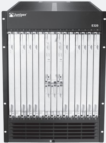
E320 BROADBAND SERVICES ROUTER