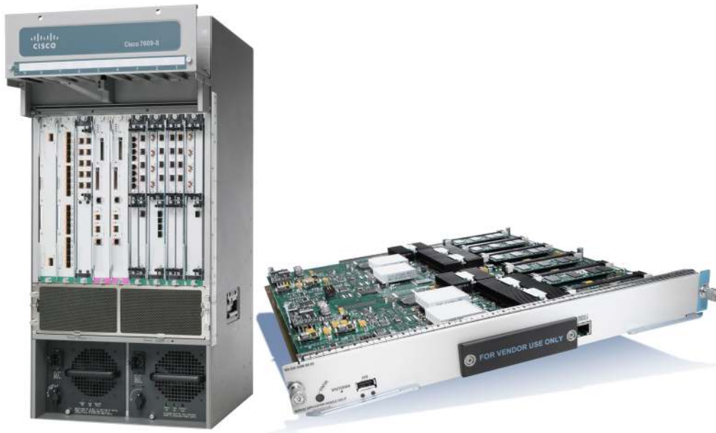
Figure 2. Cisco 7600 Series Router with SAMI Blade

The Cisco 7600 Series Router delivers robust, high-performance IP/MPLS features for a range of service provider edge applications. The physical interfaces supported on the Cisco 7600 Series platform include Fast Ethernet and Gigabit Ethernet, FlexWAN (ATM and Frame Relay), and the new line of Cisco shared port adapter (SPA) and SPA interface processor (SIP) line cards. Each Cisco 7600 Series Router provides Layer 2 connectivity and Layer 3 routing services and can host a variety of specialized applications on the Cisco SAMI module.